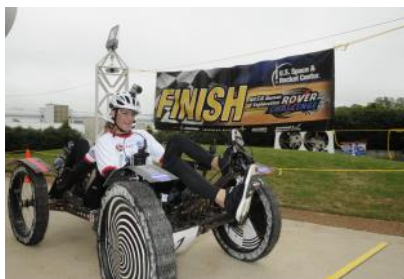
It was a big finish in 2015 for the AACT Rover program

Pathway to Space is a teacher-training program that developed and trained teachers in grade-banded NGSS-aligned curriculum kits for exploring our atmosphere through high-altitude balloons, powered flight, and instrumented rockets in partnership with the Regional Professional Development Program (RPDP). For 2016, we have received funding to add unmanned aircraft systems to the program, and aim to support high school teams in regional and statewide competitions in partnership with the DRI Green Power program.