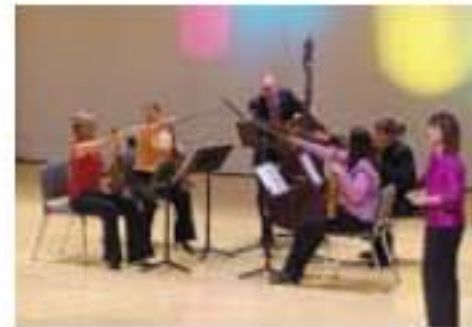
The OCS graduate quartet performs with the Nevada Chamber Music Festival during a narrated children's concert.

Four Graduate Teaching Assistantships of $14,000 each will be awarded each year of the two-year program to two violinists, a violist and a cellist. The four OCS Graduate Assistants form UNR's resident quartet, the Nightingale String Quartet, which gives public performances on campus, in public schools and throughout Nevada. These Assistantships also include reduction of the graduate fees per semester credit and a non-residency fee waiver for out-of-state or foreign students. String Scholarship assistance is also available for other qualified OCS students who do not receive a Graduate Teaching Assistantship.