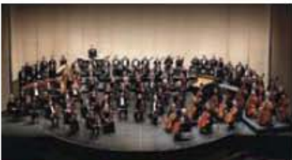
The Reno Philharmonic Orchestra is a valuable resource for professional experience.