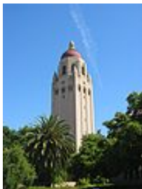
Stanford's Hoover Tower