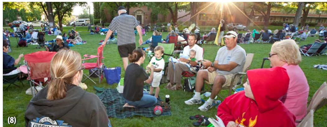
(5) 4-H Leadership Camp, (6) Lake Tahoe Music Camp, (7) and (8) Summer Concerts and Watermelon on the Quad.