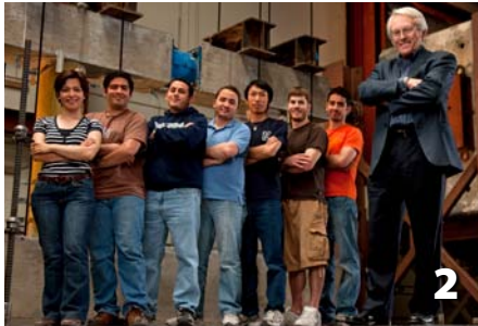
Great faculty lead the campus