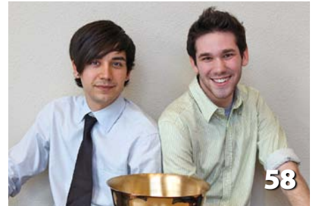
Nevada's Dynamic Duo: Nevada students win two national debate crowns in one season