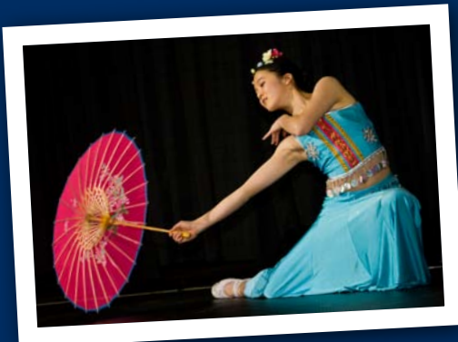
International Club, Night of All Nations, spring 2009.