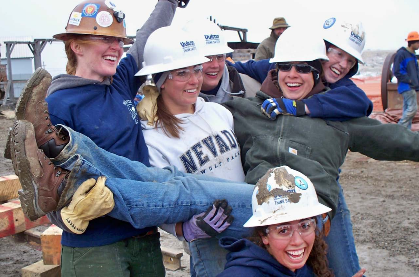
University of Nevada, Reno women's Mackay Muckers team celebrates their second-place finish at the International Intercollegiate Mining Competition in Butte, Mont., 2009.