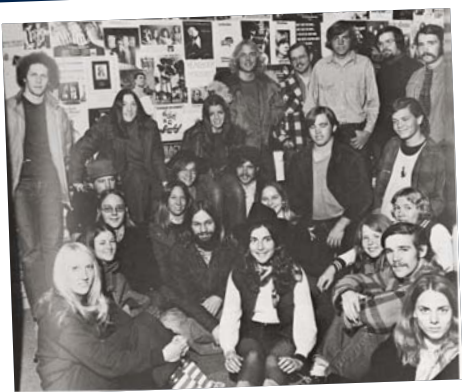
Uncle Meat's Illegitimate Children, 1972.