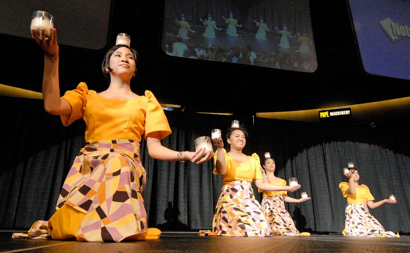
International Club, Night of All Nations performance, spring 2009.