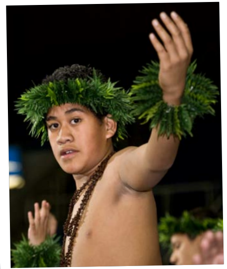
Hawaii Club Luau, spring 2009.