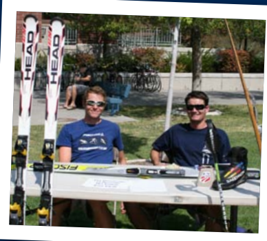
Ski Team Fan Club Club Fair, fall 2008.

"When I didn't have friends my freshman year, [members of the Black Student Organization] became some of my best friends and they have helped me transition all the way through my college life."