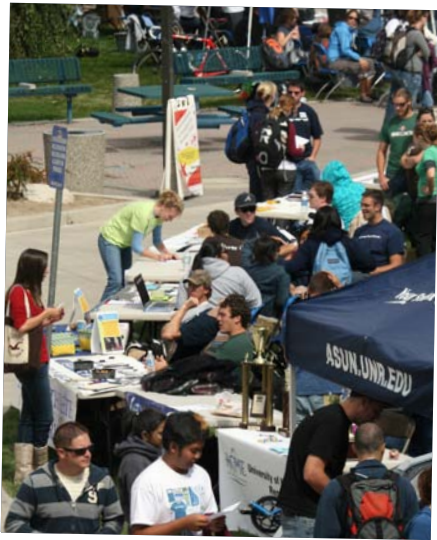
ASUN Club Fair, fall 2008.