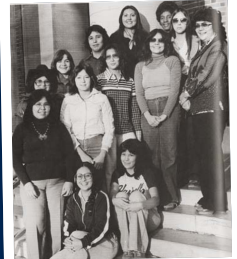
American Indian Organization, 1980.