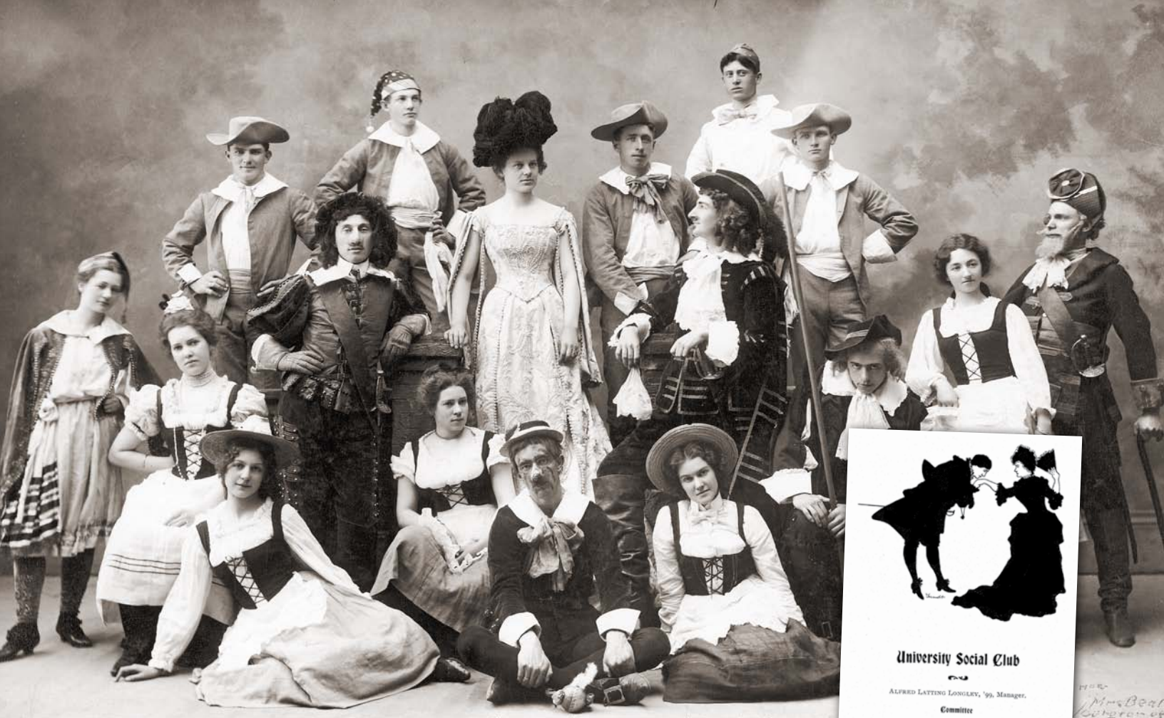
University Opera Company, presentation of "Olivette", 1900. INSET: University Social Club announcement from the 1899 Artemisia.

adviser. Just about any concept is acceptable. Currently, the campus boasts several just-for-fun, social clubs such as the Apple Poppers, a club devoted to golfing apples around campus, and the 1457 Club, a group made up of students who were roommates in the house at 1457 N. Virginia St.