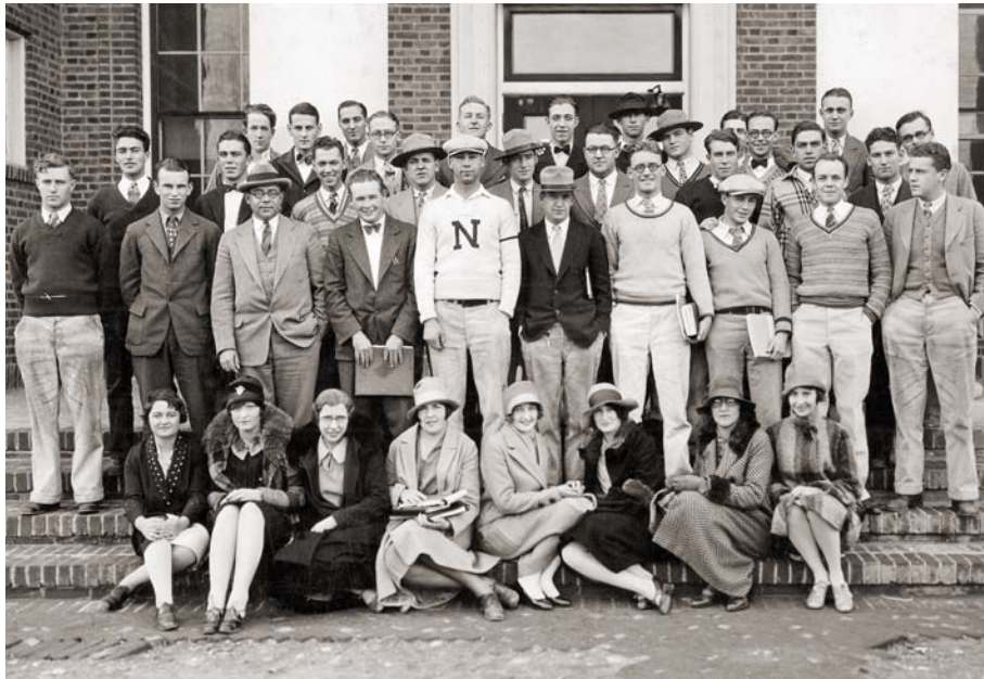
Students in the Commerce Club, 1921.

weekly meetings, did much to foster a true literary spirit," the writer notes.