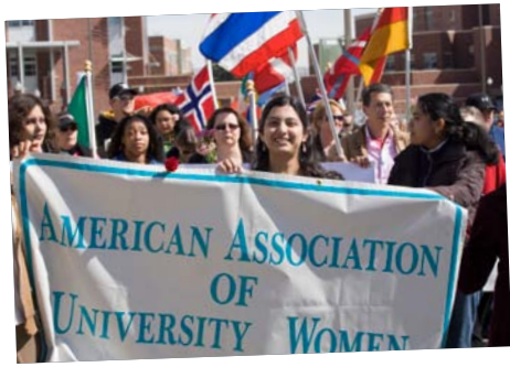
American Association of University Women Club, International Women's Day Parade, spring 2008.