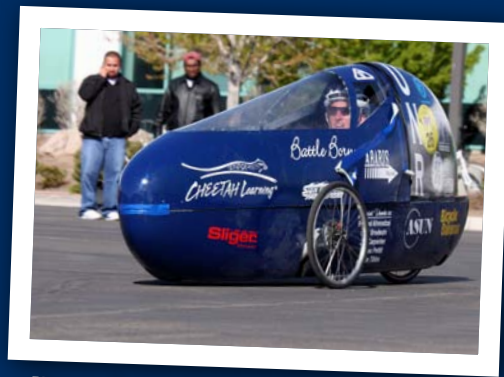
Human Powered Vehicle Challenge Club at competition, spring 2008.

Today, there are a variety of active clubs for students in the College of Science, College of Engineering, and College of Agriculture, Biotechnology and Natural Resources,