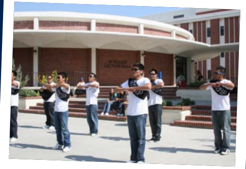
Nu Alpha Kappa Fraternity, Club Fair, spring 2008.

These multicultural groups host some of the largest and most popular annual events on campus: International Club hosts Night of All Nations, BSO hosts the BSO Ball, and the Native American Student Organization co-hosts the Spring Powwow along with the Center for Student Cultural Diversity and the Native