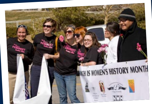
Women Without Borders Club, International Women's Day Parade, spring 2008.