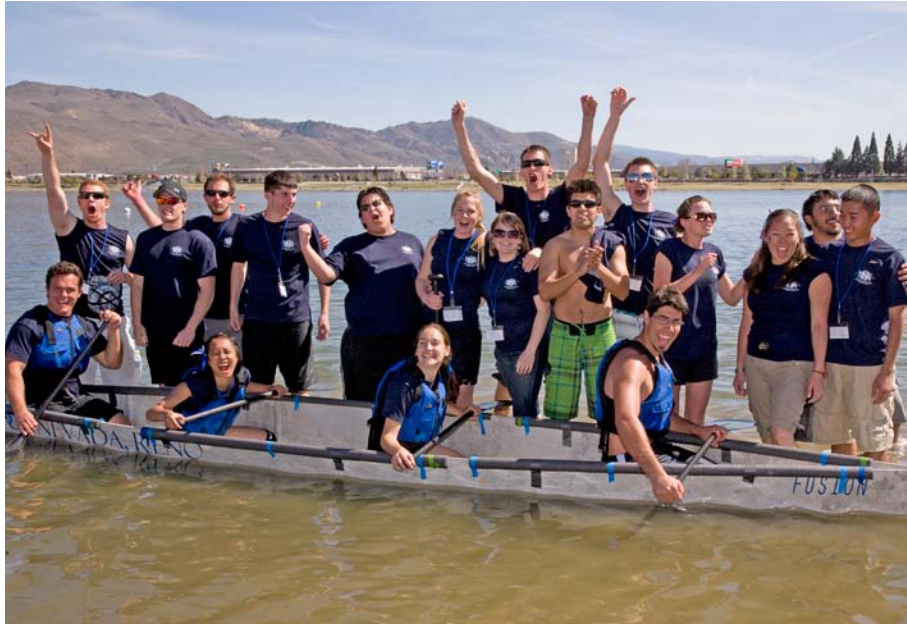
Concrete Canoe team at national competition, 2009.