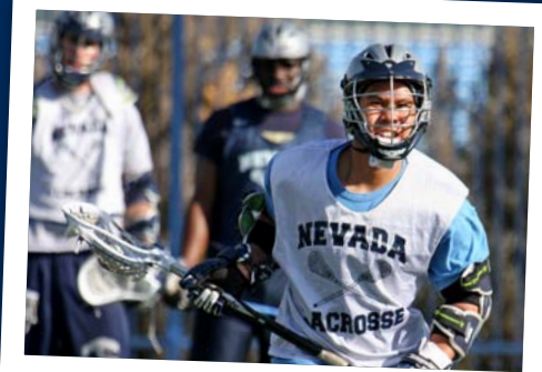
The Nevada Lacrosse Club team practice on the Intramural Fields, 2008.