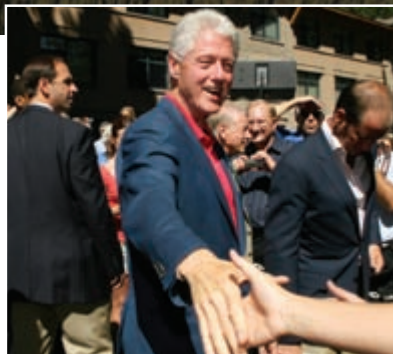
Former President Bill Clinton stopped to greet the crowd gathered at the 10th Anniversary Lake Tahoe Forum at Sierra Nevada College in Incline Village on Aug. 17. The gathering has been an annual event since 1997, when Sen. Harry Reid organized the first forum, which President Clinton also attended. At the first forum, President Clinton and Vice President Al Gore pledged $50 million in federal spending for the Tahoe basin's fragile environment.

to greater collaboration between regulating and managing bodies such as the Tahoe Regional Planning Agency and the U.S. Forest Service, the scientific community has come together, as well.