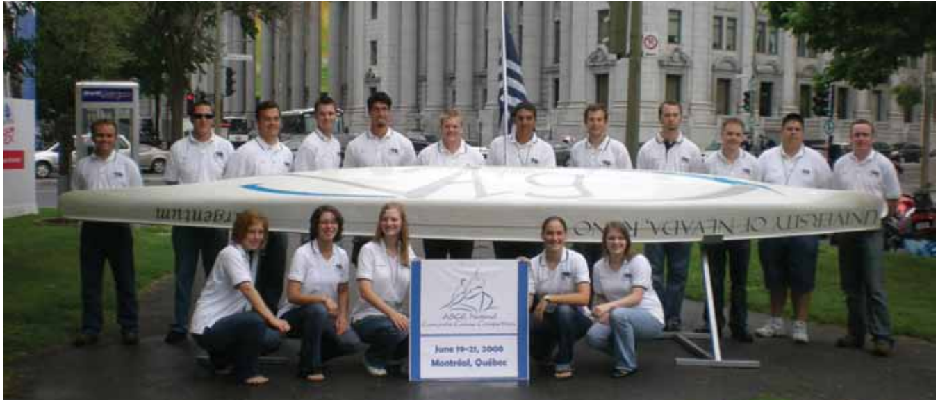
Members of the University's national championship concrete canoe team proudly pose with their championship canoe.