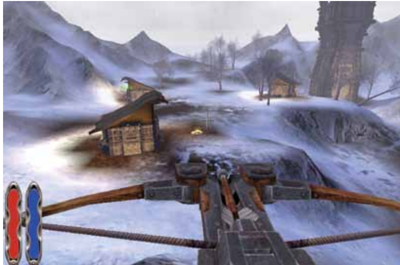
Computer Science and Engineering faculty are making full use of the wonders of visual communication and digital interactivity through academic offerings such as those pictured above.