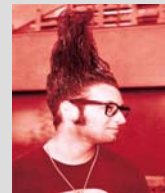
Avoid extreme or unkempt hairstyles.