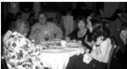
CEDS Members enjoying the social