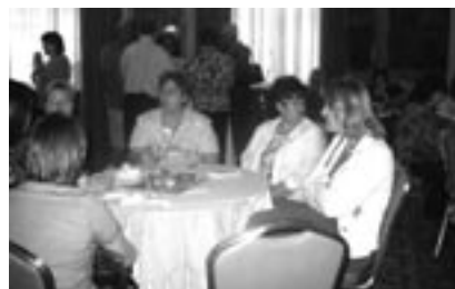
CEDS Members enjoying the social